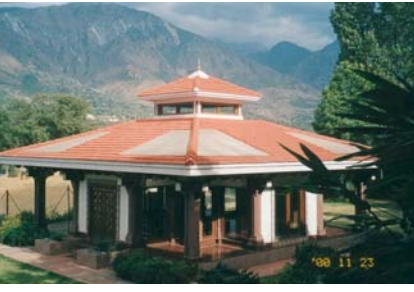
Gurudev's Samadhi in Sidhbari